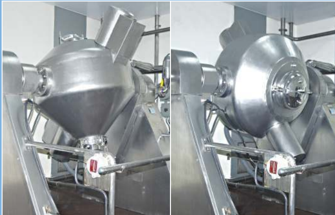
Ideal drying solution for Oxidic Materials.