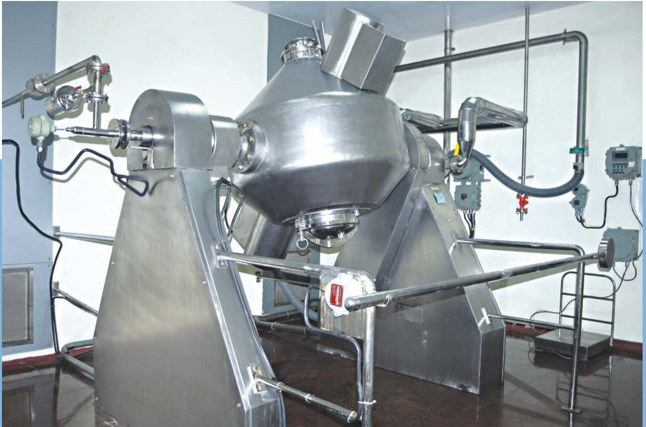
400 Ltrs. RCVD with 2 nos. choppers.

The Roto Cone Dryer with improved technology integrates drying operation under vacuum. The Roto Cone Dryer facilitates enhanced drying efficiency low temperature operation and economy of process by total solvent recovery. It helps cGMP - based working by achieving optimum dust control, while offering the advantage of efficient charging and discharging of materials. The dryer is also available with an optional thermal medium system.