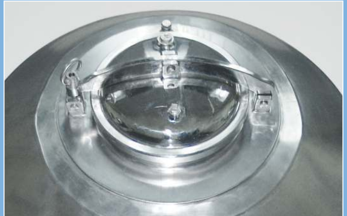
Easy operational manhole on a single knob.

Specification and technical data are subject to without prior notice