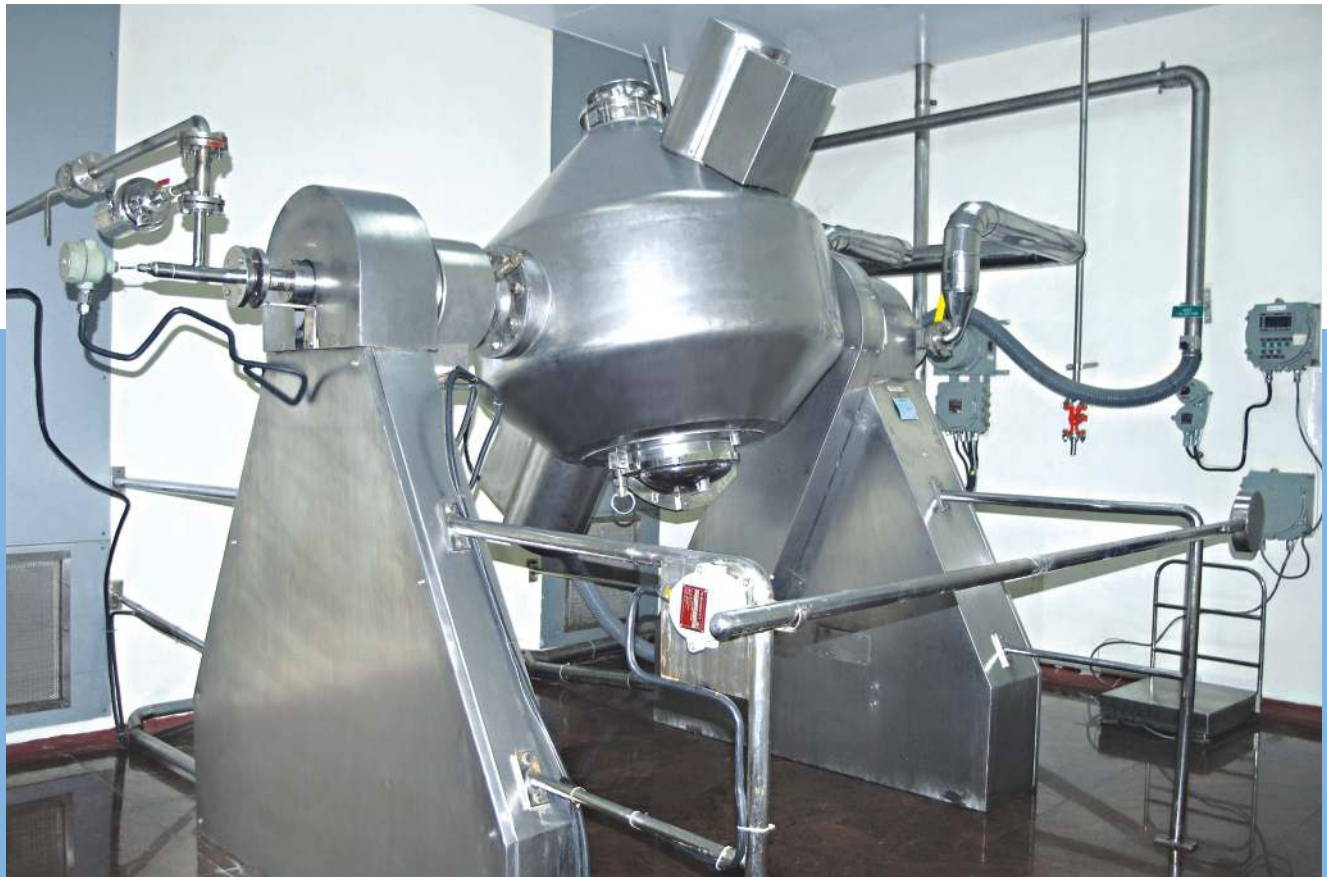
400 Ltrs. RCVD with 2 nos. choppers.

The Roto Cone Dryer with improved technology integrates drying operation under vacuum. The Roto Cone Dryer facilitates enhanced drying efficiency low temperature operation and economy of process by total solvent recovery. It helps cGMP - based working by achieving optimum dust control, while offering the advantage of efficient charging and discharging of materials. The dryer is also available with an optional thermal medium system.