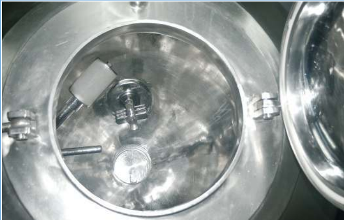
Knife edge chopper blades and the vacuum filter.